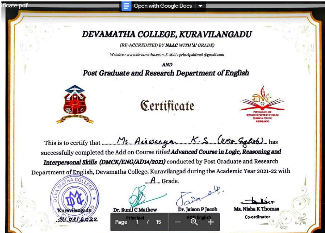
Attendance of participants